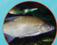
Bream ( Abramis brama )