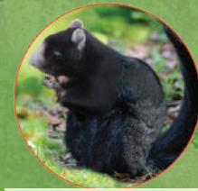
Fox Squirrel ( Sciurus niger )