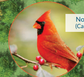
Northern Cardinal ( Cardinalis cardinalis )