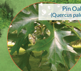
Pin Oak ( Quercus palustris )