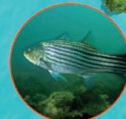
Striped Bass ( Morone saxatilis )