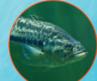
Largemouth Bass ( Micropterus salmoides )