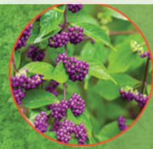
Beautyberry ( Callicarpa americana )