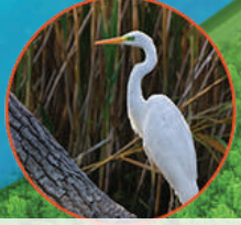
Great Egret ( Ardea alba )