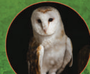
Barn Owl ( Tyto alba )