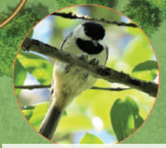
Carolina Chickadee ( Parus carolinensis )